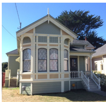
Annie B Ryan Historic House and Gardens 1000 F Street New Home of the Eureka Heritage Society